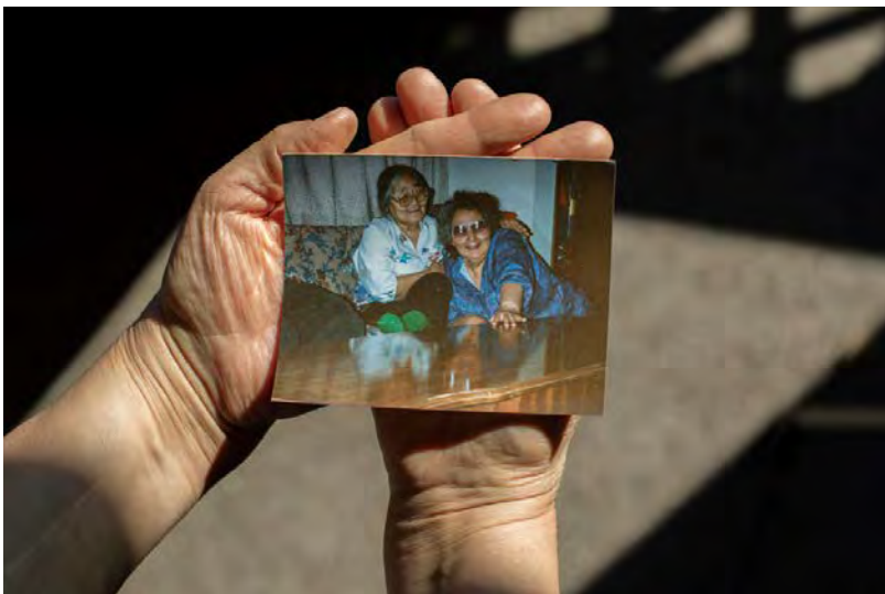
"Mom, Aaka, and Grammy"