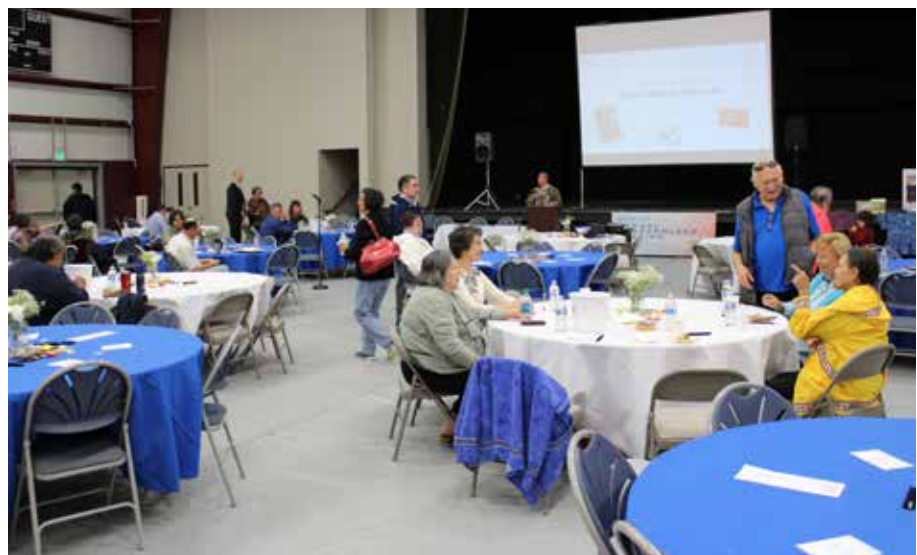
Shareholders visiting and gathering at The Center in Anchorage on June 3.