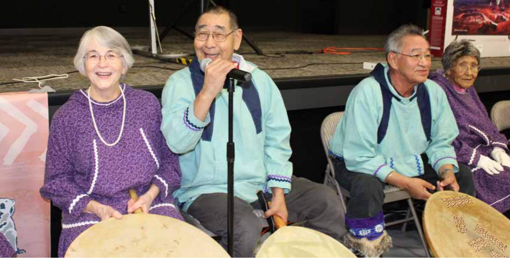
Kingikmiut dancers at the meeting in Anchorage on June 3.