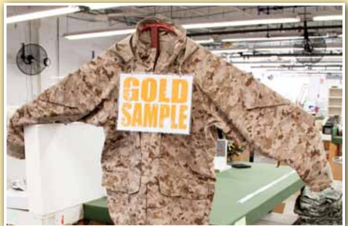
SNCT GOLD SAMPLE.