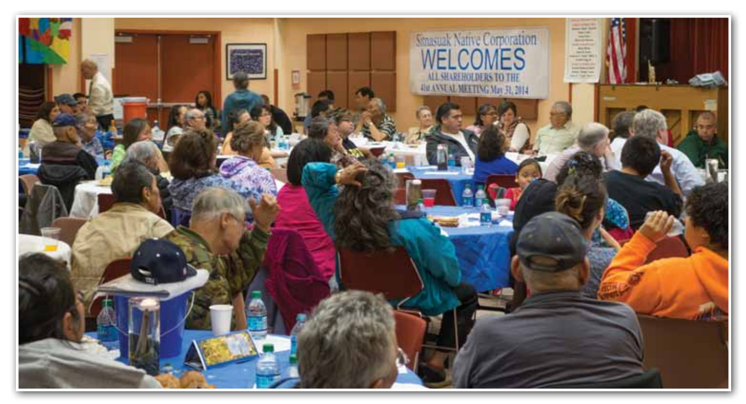
SITNASUAK ANNUAL MEETING, MAY 31, 2014

Will the meeting be accessible online? Yes. Sitnasuak will be live streaming the meeting online. You will find the link to the live stream video by visiting our website, at www.snc.org, or by clicking the link on our Sitnasuak Native Corporation Facebook page.